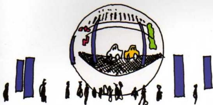
KAPOOR: Unconscious WONDER

EUROPE € 11, UK £ 8 OCTOBER/NOVEMBER 2006