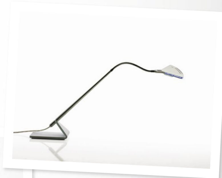
↑ The Milanese design duo Alberto Meda and Paolo Rizzatto combined elegant aesthetics with remarkable energy efficiency in their MIX for Luceplan, an LED-based reading lamp that consumes just five watts and lasts up to 50,000 hours per bulb. When turned off, the adjustable aluminum stem remains illuminated with blue light, so it’s easy to locate when things go bump in the night; $590. www.luceplan.com