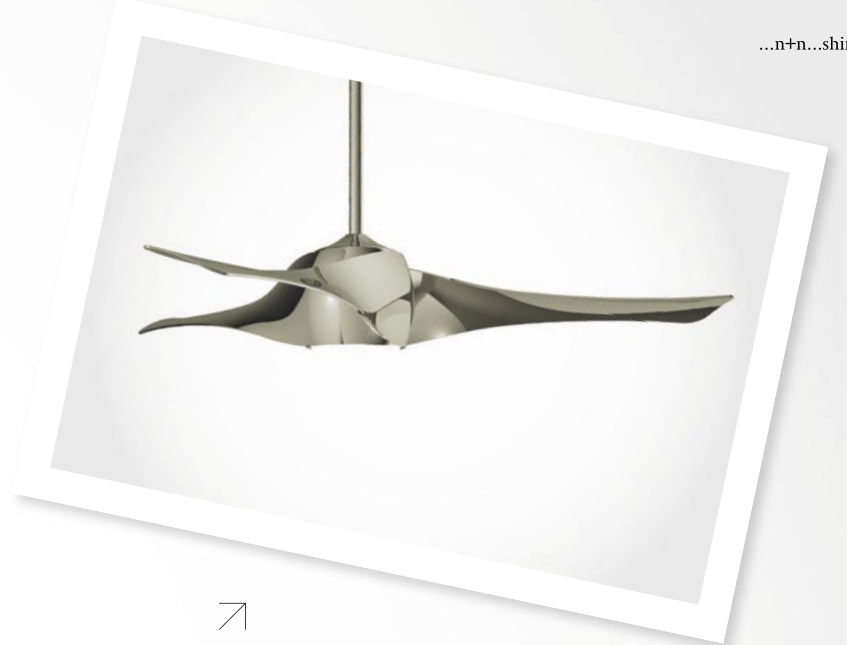
↗ The ARTEMIS ceiling fan wants to be more sculpture than fixture: Its blades wrap around a concealed motor and taper at their tips like birds’ wings, making them spin faster and more silently than the average ceiling fan. With the liquid nickel finish shown here, $670. www.g2art.com