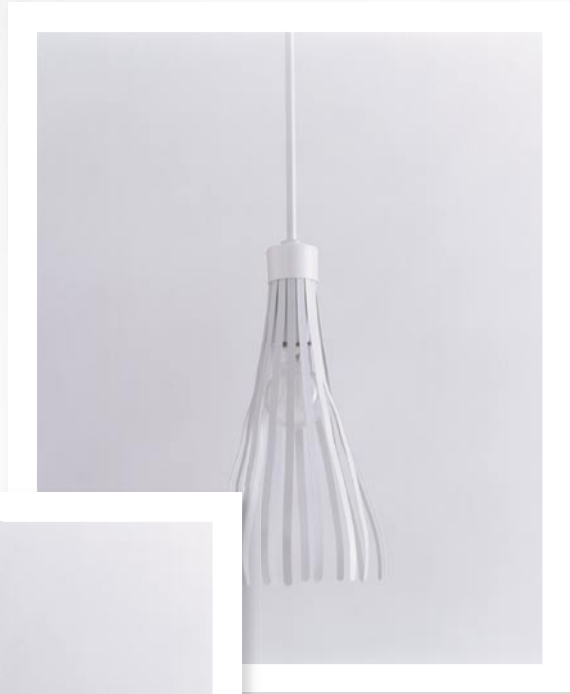
← HANABI, designed by the Tokyo-based firm Nendo, is a metal alloy lamp that responds to the heat of an incandescent bulb by opening its “petals” when illuminated and reverting to its original shape when turned off. The lamp’s name means “fireworks,” which is derived from the Japanese words for “fire” and “flower.” Both “fade away so quickly and easily,” Nendo notes. Contact designer for price. www.nendo.jp